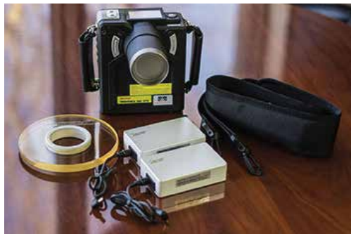
The Image-Vet FleXX™ requires NO installation or assembly. Its two rechargeable batteries, neck strap and back scatter shield all fit conveniently in the supplied hard-shelled transport case (not pictured).