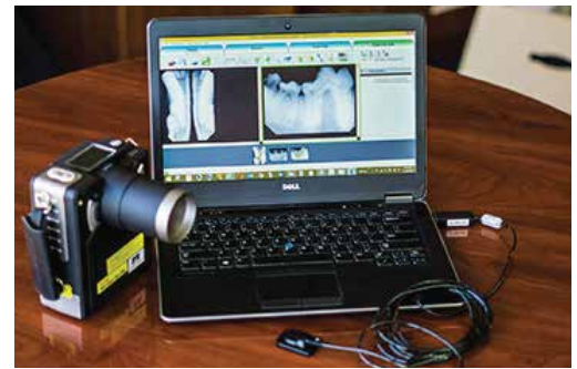
The Image-Vet FleXX™ integrates seamlessly with EVA Vet Digital Dental Imaging Systems and can be used with other higher quality digital sensors and high speed dental films. Ask about a package deal for greater savings!