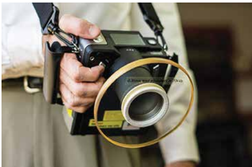
The neck strap protects the Image-Vet FleXX™ and allows for simple and easy one-handed operation, allowing the user total FleXXibility to operate acquisition software, position the digital sensor or tend to the patient.

- DR. KATE KNUDSON (VETERINARY ECONOMICS - Case Studies: Make sure new equipment earns its keep)